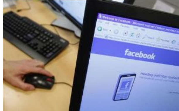
The offer, made by Facebook, has created a record of sorts in NIT Warangal.

HYDERABAD: It's raining lucrative jobs at NIT Warangal which has had the best placement season so far. The 51-year-old institute started its recruitment drive on August 15 and already has a 21-year-old fourth year B.Tech. computer science student securing the highest ever pay package of Rs 45 Lakhs per annum. The offer, made by Facebook, has created a record of sorts here.